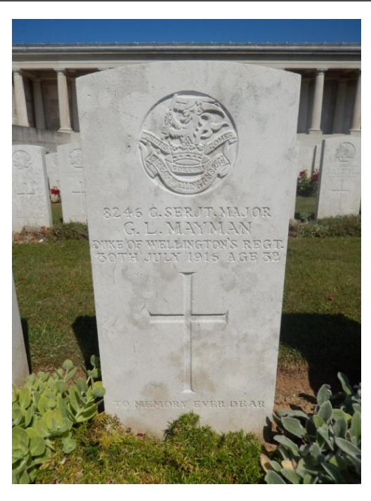
Headstone photograph by courtesy of Philippe Clerbout.

Commemorated in perpetuity by the Commonwealth War Graves Commission