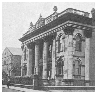
Wesleyan Church, Wesley Street, OSSETT.