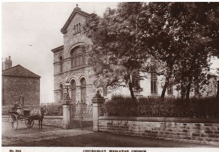
CHICKENLEY WESLEYAN CHURCH